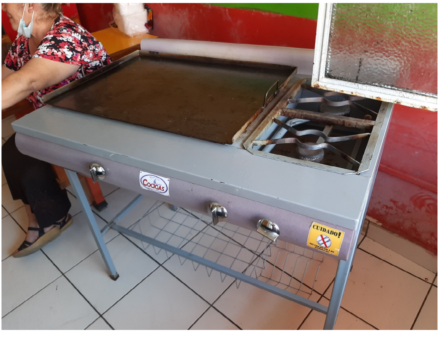
Figure 2. Griddle for pupusas transported from its place of origin