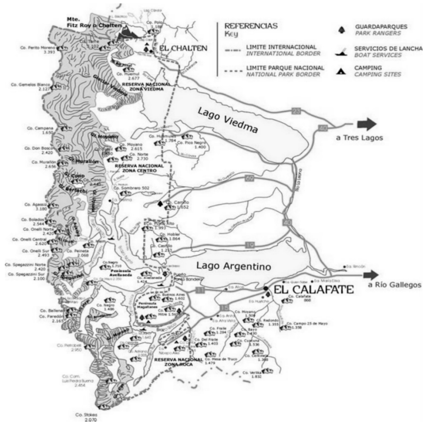
Figure 3. Campos de Hielo Sur in Argentine maps

Source: Los Glaciares National Park Argentina (n.d.).