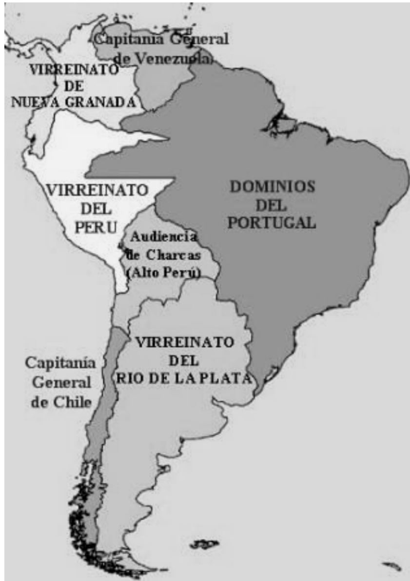
Figure 1b. Viceroyalty of Río de la Plata