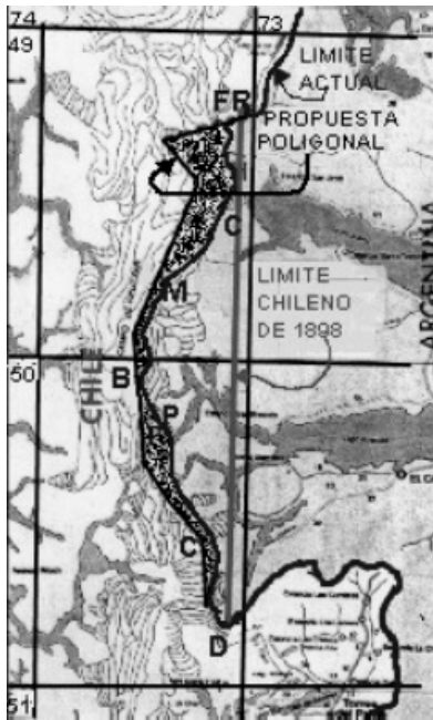
Figure 2. Territorial changes in maps of the Campos de Hielo Sur