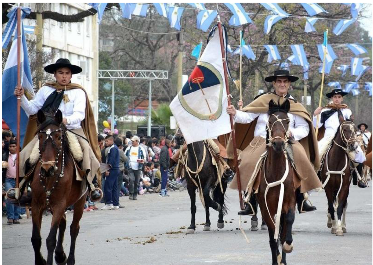
Figure 6: Ceremony evocative of the Jujuy Exodus