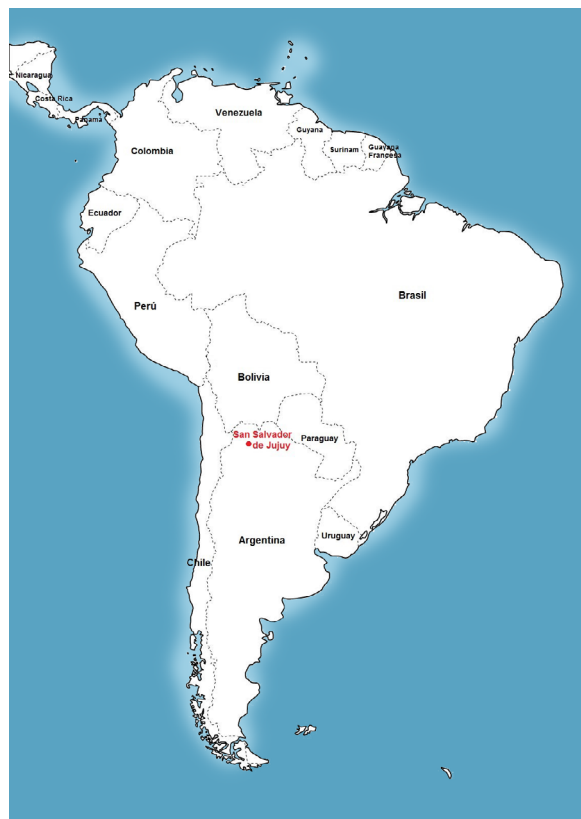
Figure 1: Map of South America

and the border; the province and the valley region, among which also circulates a historical experience in each of these cases. Nevertheless, imagining the city as a local space in a context of crossings as specific as in the San Salvador de Jujuy case requires assuming the agency of the local over and above the path of the global, the national, or even the regional (Massey, 2005). Here, we refer to the common difficulties of observing specific situations in the context of analysis, when the terrains being analyzed are not those most commonly seen in the academic, political or media context. Many studies on cities refer to context in which notions such as metropolises, 4 megacities (Bolle, 2008), or megalopolises (Freitag, 2012) or the role of periphery cities as a function of global cities (Sassen, 1999) are at the forefront. Allusions to Latin American, Argentina, and Northwest Argentina features are common, as if it was possible to amalgamate a whole series of differentiated historical process and specific cultural frameworks in one metalepsis. Beyond this, there has been a tradition that considers the foundational factors of Latin American urbanities as revolving around the colony and the configuration of nation-states (Martínez, 1997; Rama, 1998; Romero, 2010). All of these warnings are taken into account when constructing a problematization that focuses on San Salvador de Jujuy, a medium-sized city and capital of a border province (See Figure 1).