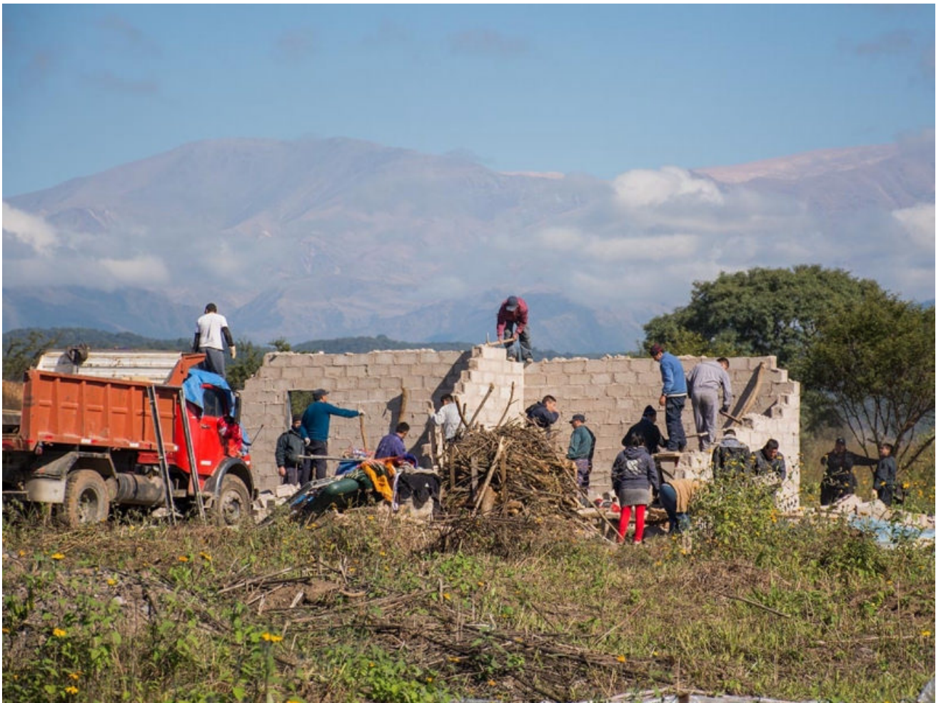
Figure 4: Disassembled popular settlement