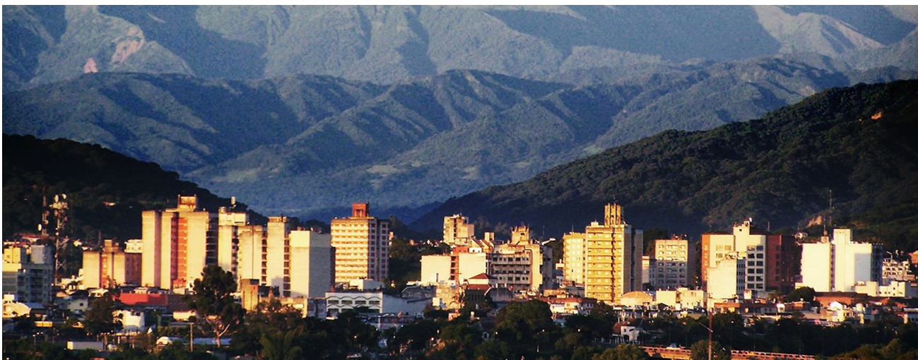
Figure 3: Panoramic image of Jujuy