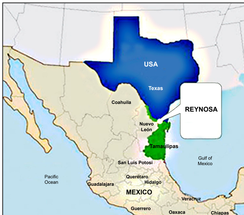
Figure 1: Geographical location of Tamaulipas