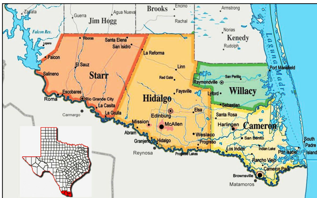
Figure 4: Counties and cities in the Rio Grande Valley

According to Barajas (2015), there are four levels of intervention in the cross-border relations between Mexico and the United States: trilateral (including Canada), bilateral, transboundary (states and municipalities on both sides of the border) and state and local. 7 In these last two levels, paradiplomatic activity has been consistent, and its impact in the area has been positive because the cross-border region, and not the cities, is promoted. In this sense, linking activities between Tamaulipas and Texas have improved the area of the Rio Grande Valley or as the inhabitants call it, the “Magic Valley of Rio Grande” (Figure 4). This area includes the Starr, Hidalgo, Willacy and Cameron counties; the cities McAllen (Hidalgo), Edinburg, Harlingen, Brownsville and Isla del Padre (Sandoval, 2007); and the municipalities Nuevo Laredo, Reynosa and Matamoros.