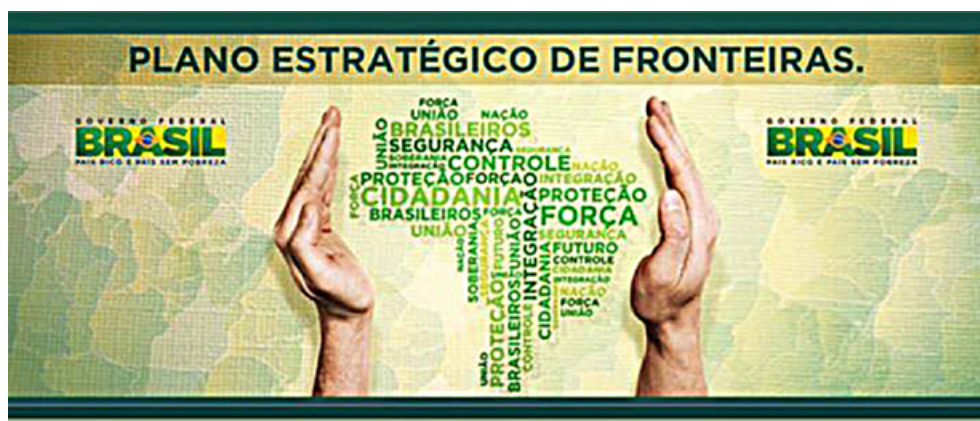
Figure 4. A “Detached” Brazil

Source: Image used in the official launch of “Plano Estratégico de Fronteiras [Strategic Border Plan] (PEF),” June 8, 2011, in the Palacio del Planalto.