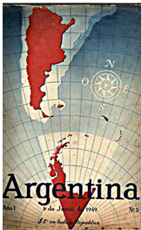
Figure 3. A “detached” Argentina